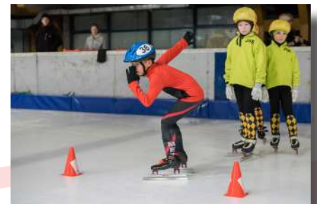
Serbia Open 2018. skill races